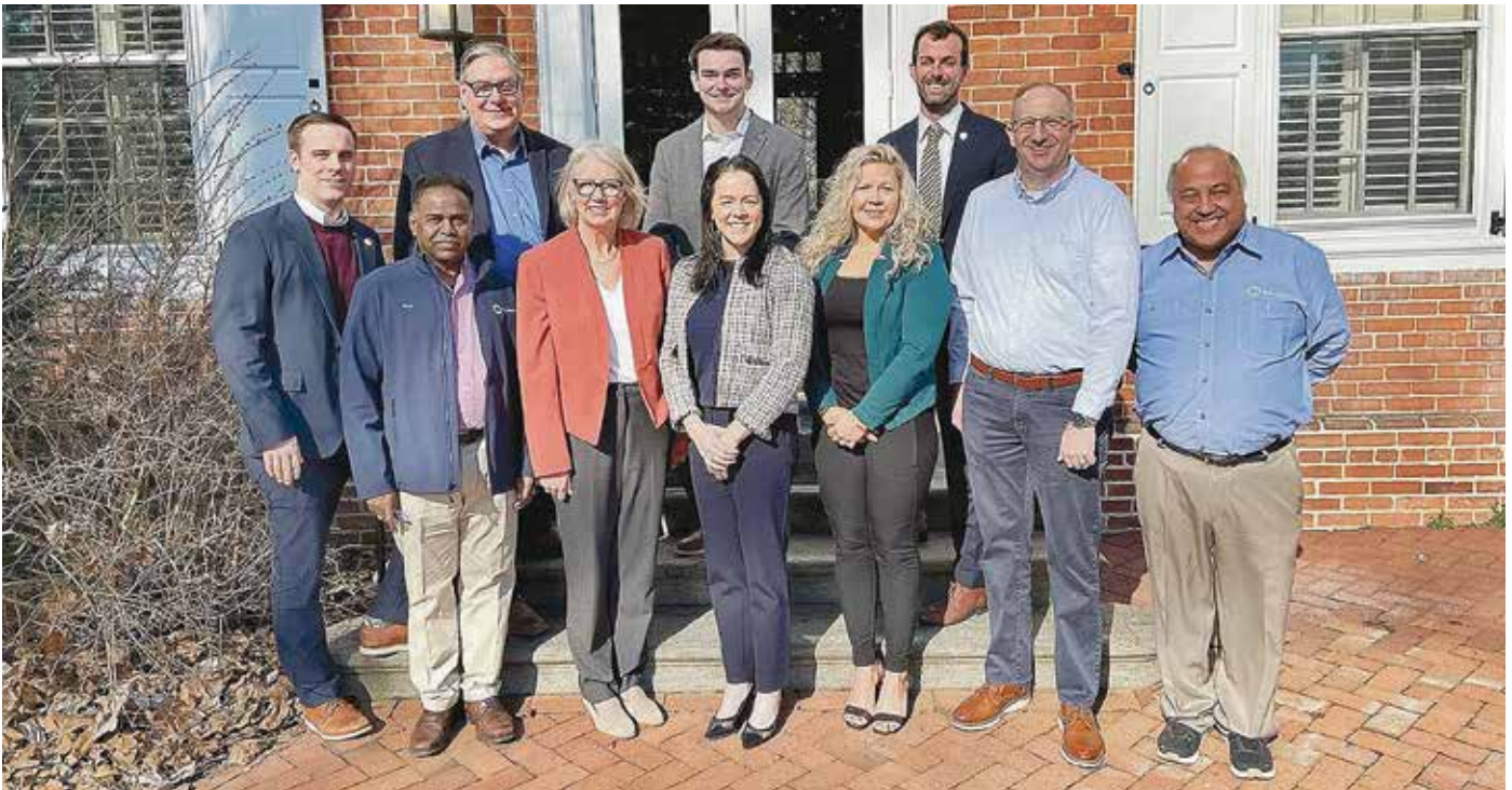
The picture above is from the Council on Development Finance meeting where FFI Ionix received the approval of the Graduated Lab Space Grant.

Through their long-term presence and capital investments, companies like FFI Ionix demonstrate their unwavering commitment to fostering economic growth and creating valuable opportunities for the community. This underscores Kent County's reputation as an exceptional location for businesses to thrive, thanks to its supportive ecosystem, skilled workforce, and strategic partnerships. Such success is further facilitated by the support and strategic initiatives of organizations like the Kent Economic Partnership, dedicated to driving economic growth in Kent County through business attraction, retention, and expansion.