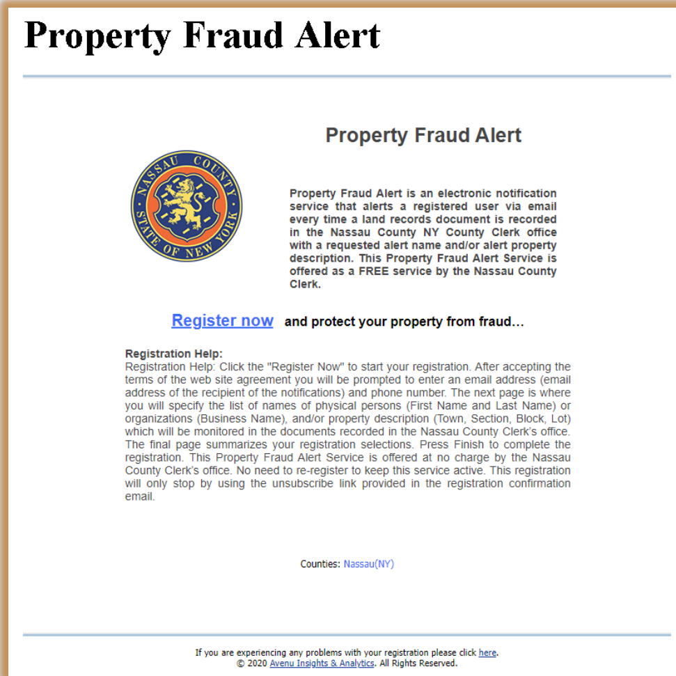
This is what AVENU does for Nassau County. Ours will be similar. Estimated release date is TBD