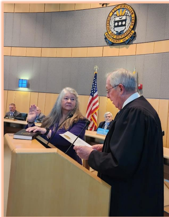
Jan 3, 2023 w/Judge Witham